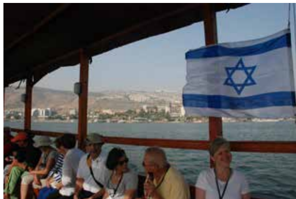
Learning on a boat in the Sea of Galilee