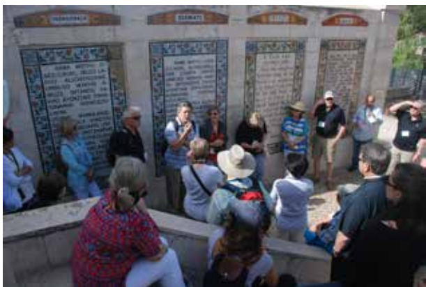
The Lord's Prayer is presented in more than 100 different languages